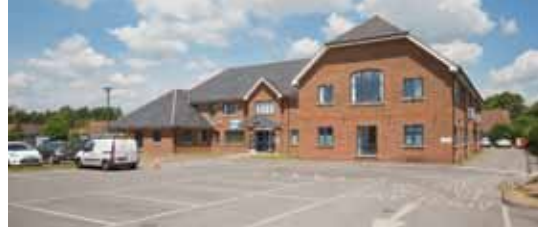
Highfield House Car Parking