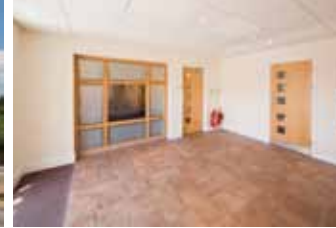
Highfield House Entrance Hall